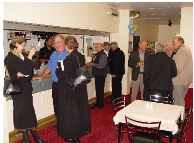
RCO-OTH 09.08.10: General melee!