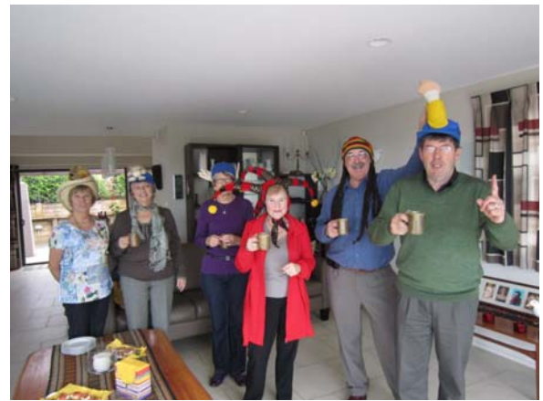
RCO-OTH 09.08.10: Ministry of Funny Hats!