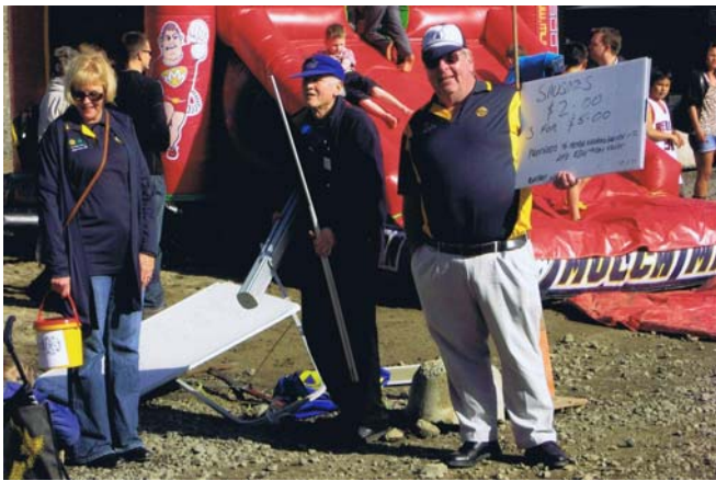
RCO-OTH 09.08.10: One last reminder!