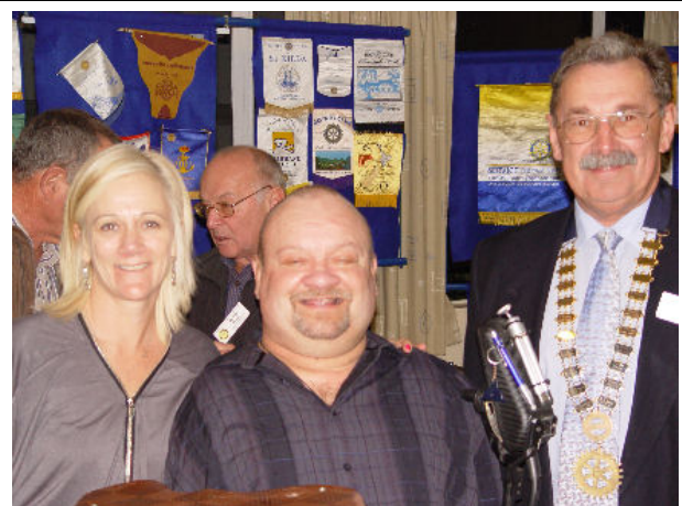
RCO-OTH 09.08.10: The cup is half full!