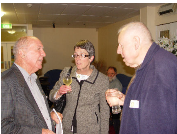
RCO-OTH 09.08.10: Absolutely riveting!