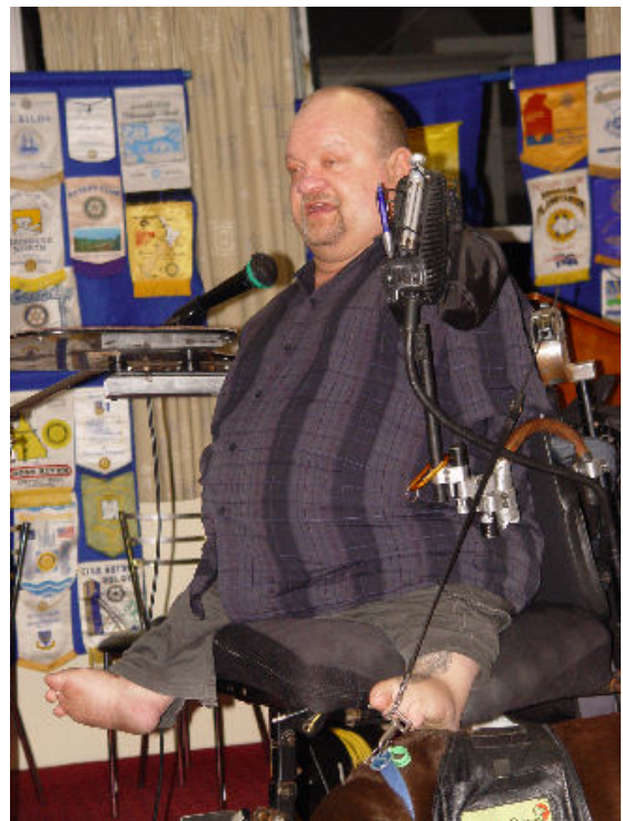
RCO-OTH 09.08.10: Now I'm up to your height!