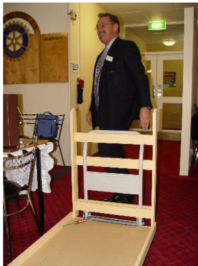
RCO-OTH 09.08.10: Can I be first?