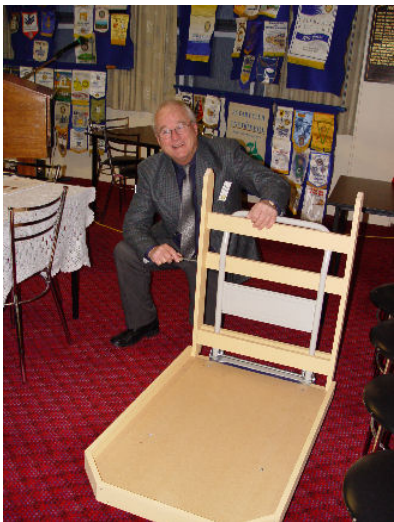
RCO-OTH 09.08.10: The Howie Mobile - lessons coming!