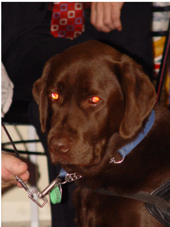
RCO-OTH 09.08.10: I just get this look in my eyes!